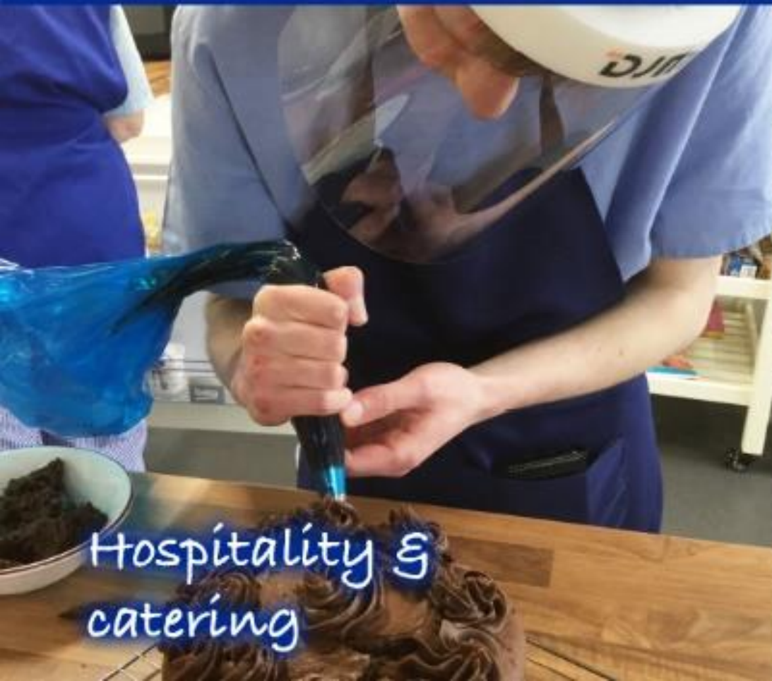
Hospitality & catering